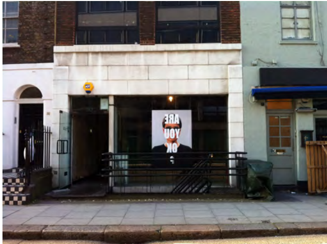
ARE YOU OK? Hanmi Gallery London February 2014